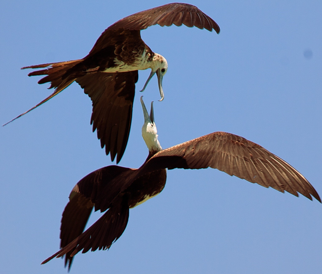
Magnificent Frigate Birds