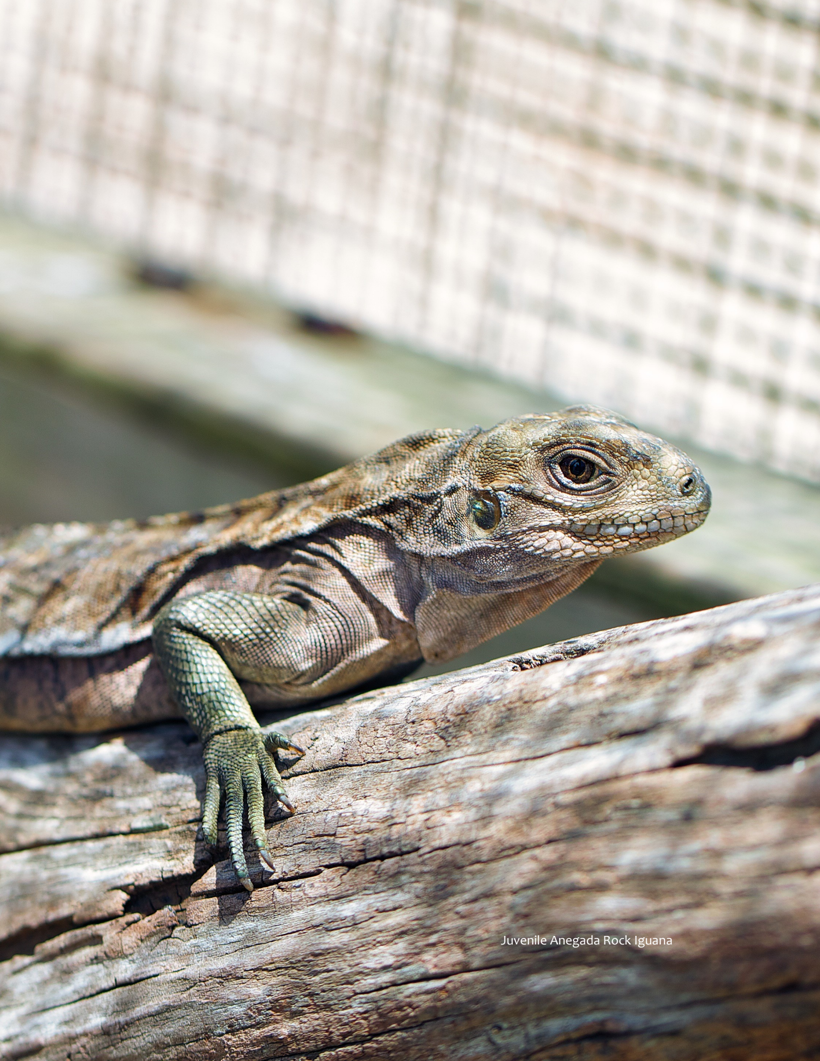
Juvenile Anegada Rock Iguana