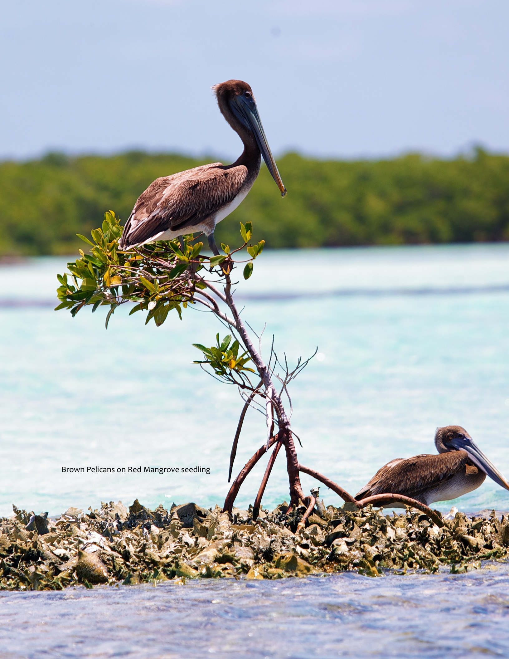
Brown Pelicans on Red Mangrove seedling