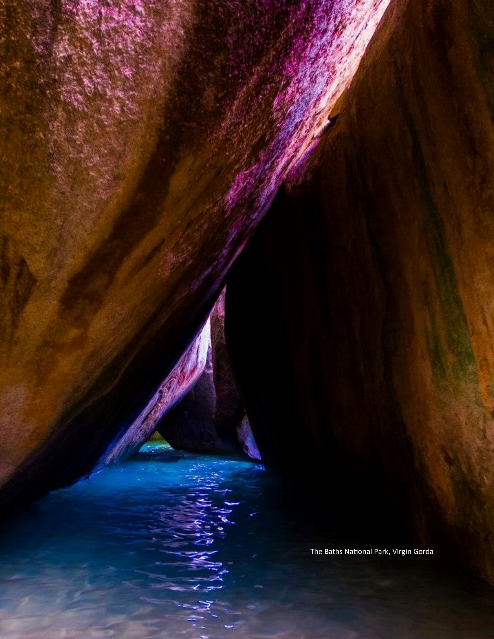
The Baths National Park, Virgin Gorda