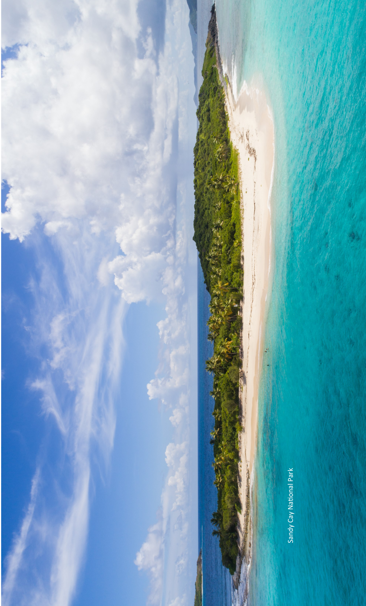
Sandy Cay National Park