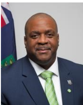
Honourable Andrew Fahie Premier and Minister for Finance of the Virgin Islands

National parks and protected areas bring about joy, happiness, inspire young minds and the young at heart, bring families together and enriches our livelihoods. Let us continue to build upon the legacy left by those who came before us. I implore you to generously support the National Parks Trust, let us have the foresight to do what it takes to protect these treasures for generations to come.