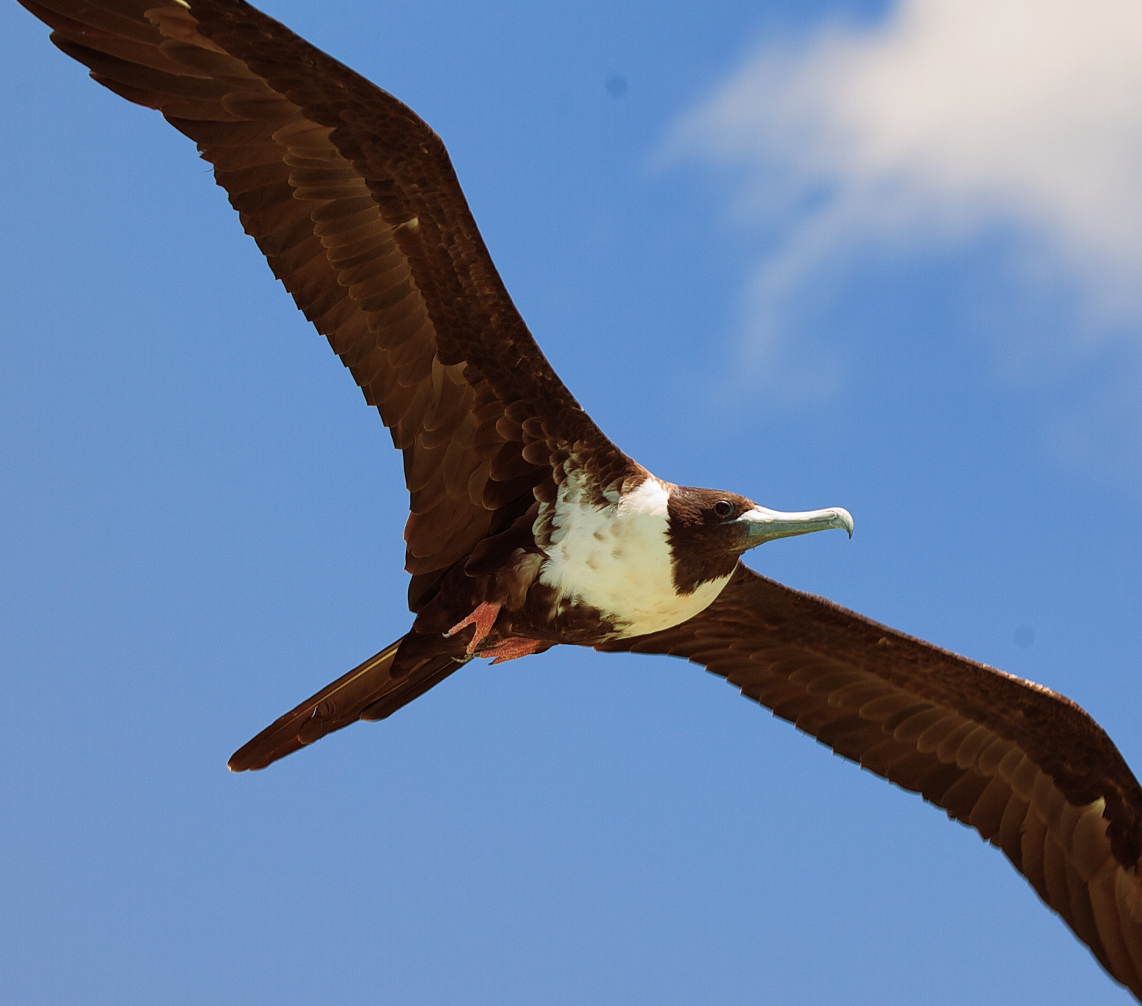
Magnificent Frigate Bird