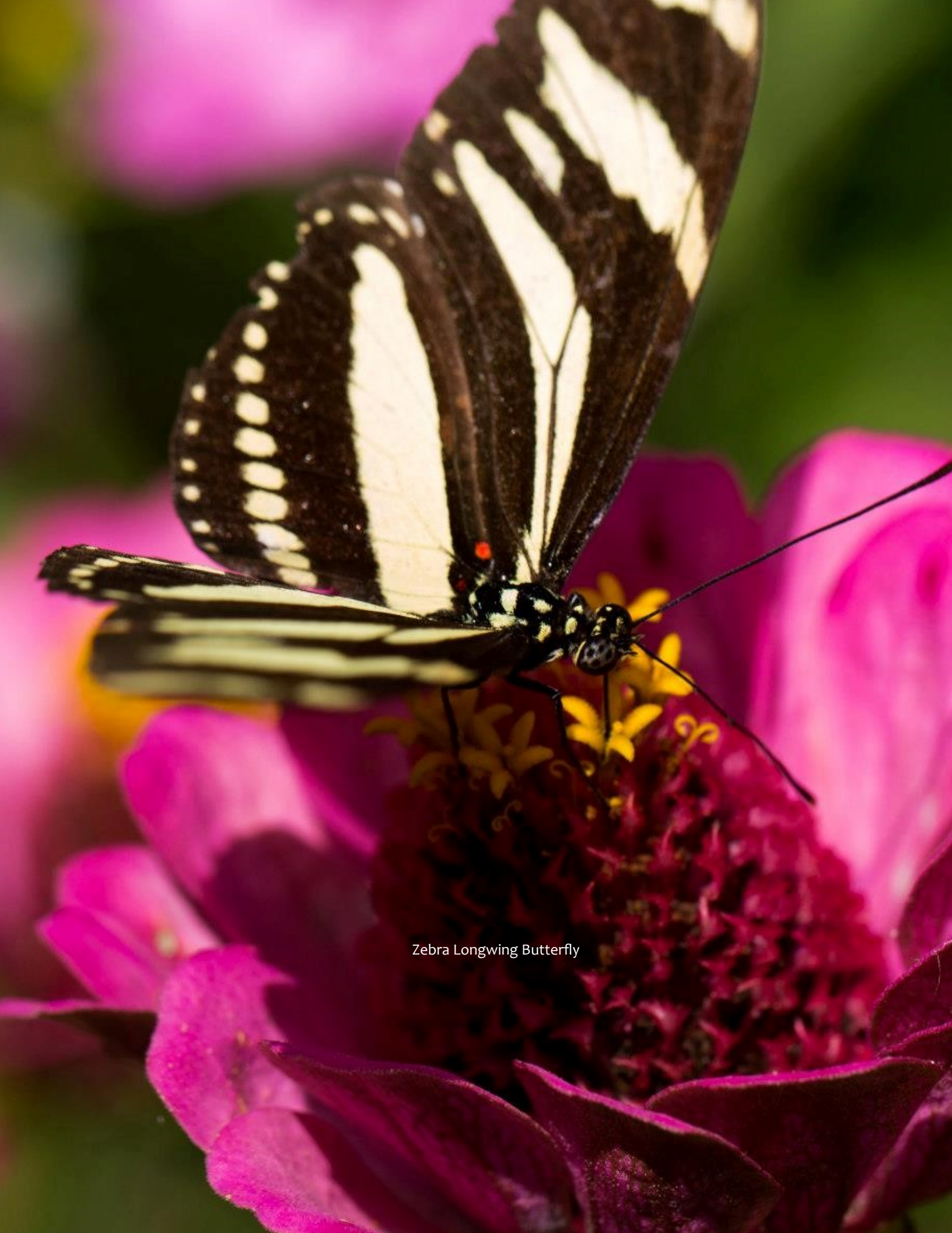
Zebra Longwing Butterfly