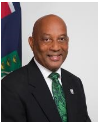
Honourable Vincent Wheatley Minister for Natural Resources, Labour and Immigration

The protection of the environment is our collective responsibility, national parks and protected areas allow us to protect the best of our natural history, heritage and environment—stunning landscapes and seascapes, extraordinary wildlife and magnificent forests. These protected areas form the basis of our economic and social wellbeing. They serve as refuge for threatened and endangered plant and animal species unique to these Virgin Islands, attracting millions of visitors to our shores. By generously supporting the National Parks Trust, you will ensure that our natural resource is conserved not only for our residents and guests, but for future generations. The Tourism industry and our livelihoods depend on our ability to conserve and preserve our historic, cultural and environmental assets. As a non-profit environmental organisation the NPT needs your support as we endeavour to achieve and sustain a pristine environment.