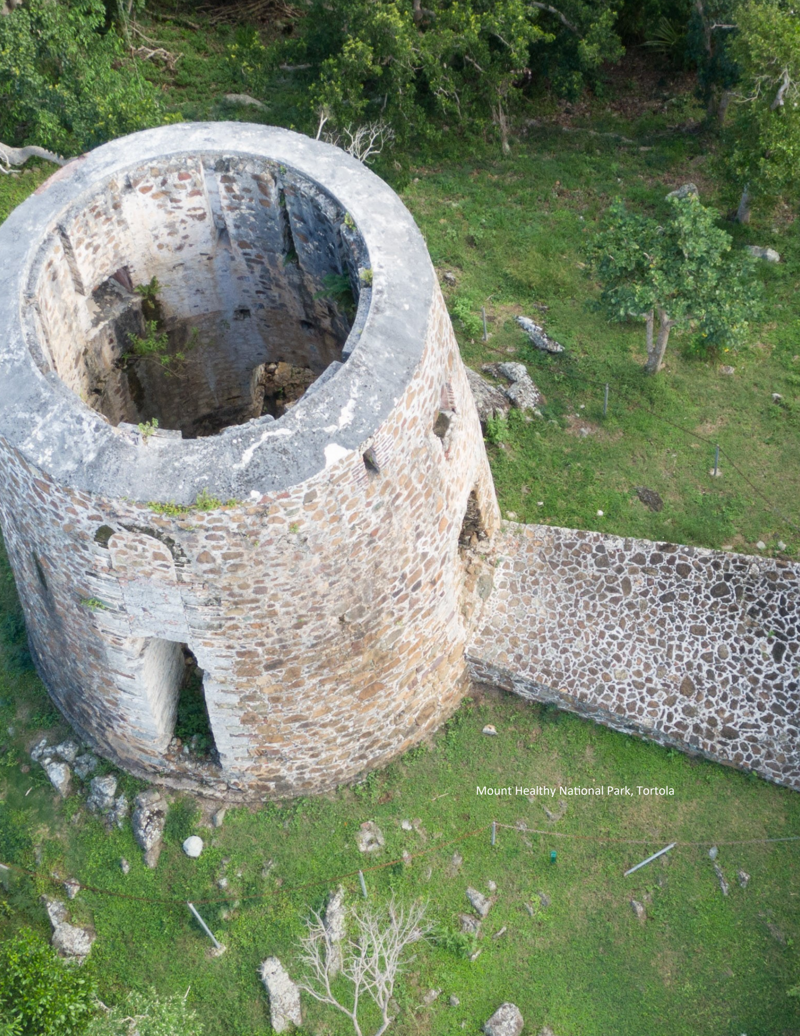
Mount Healthy National Park, Tortola